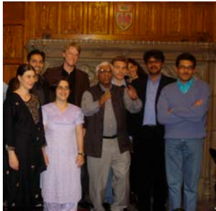
Students and Faculty