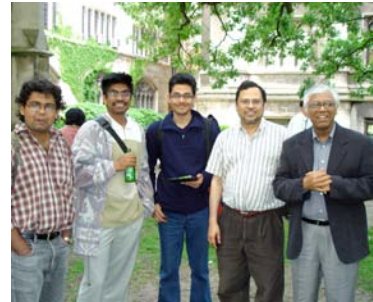
Students and Faculty

The following pages briefly describe the requirements of the Department's Ph.D. degree program, sources of financial aid for graduate students, and resources for the study of South Asia at the University of Chicago. Please also refer to the Departmental web pages for updated information. Degree requirements are set out in detail, but the notes on other topics found here are intended to provide only general introductions. Names, and phone numbers, e-mail and office addresses of Departmental and other University personnel mentioned in this Handbook will be found on the University websites.